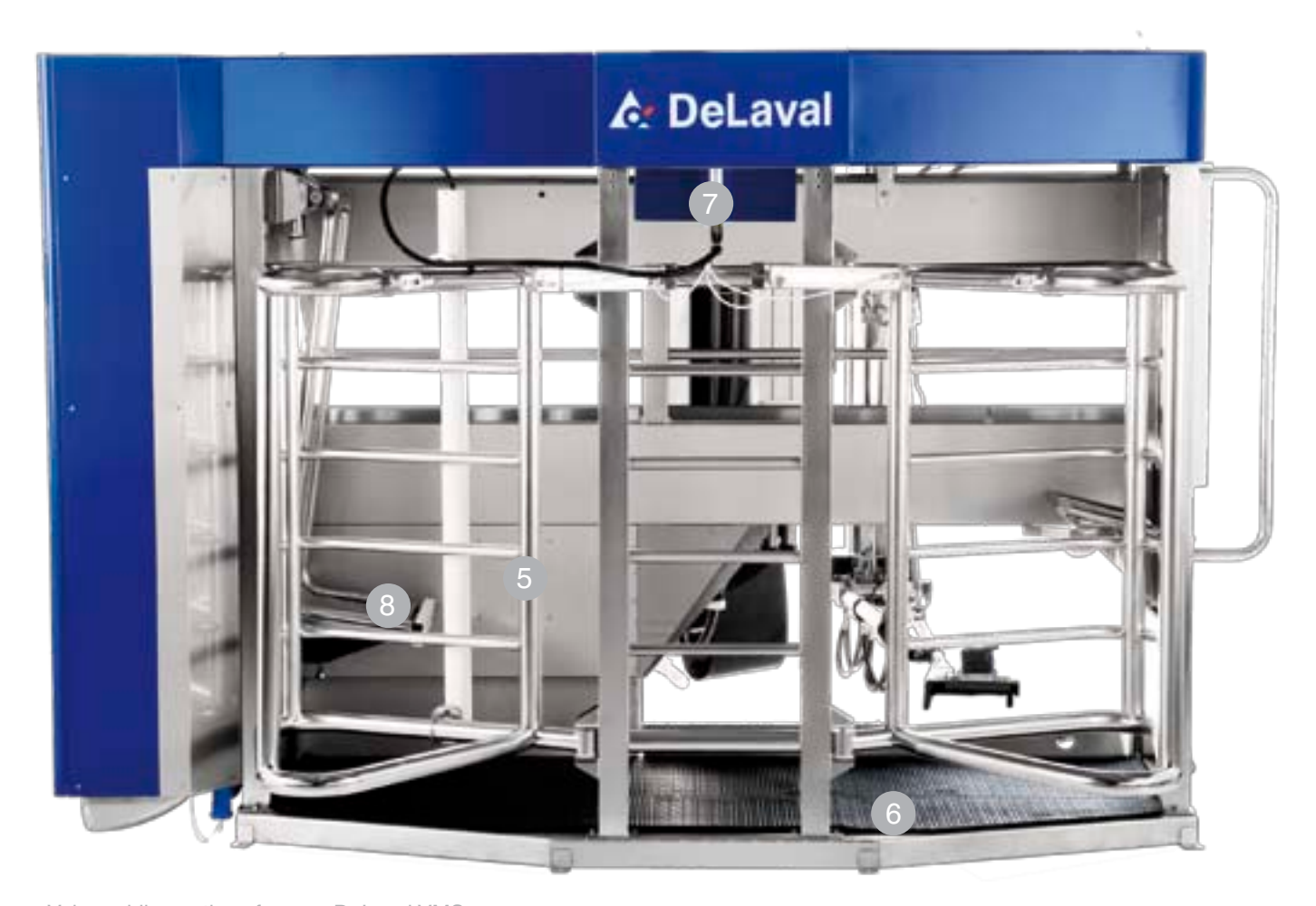
Value adding options for your DeLaval VMS