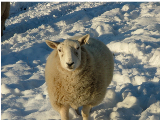
Who'd be a sheep in Topcliffe?

Not content with that, you had to get a mention in the newspapers for a broken pipe in Thirsk around Christmas. Ok, this might not have been your favourite Christmas moment, but what the heck! Surely it was worth it for the moment or two of fame.