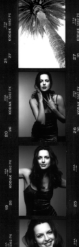
BACK OF FRONT COVER

Words and music by Holly Long All songs ©2000 Longsongs Music (ASCAP) except JUST FINE ©2000 Longsongs Music (ASCAP)/Jamnation Music(BMI) Lyrics Reprinted by Permission. All Rights Reserved.